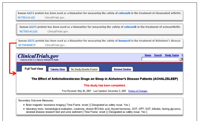
IPA prioritizes biomarker candidates in support of better screening of toxicity